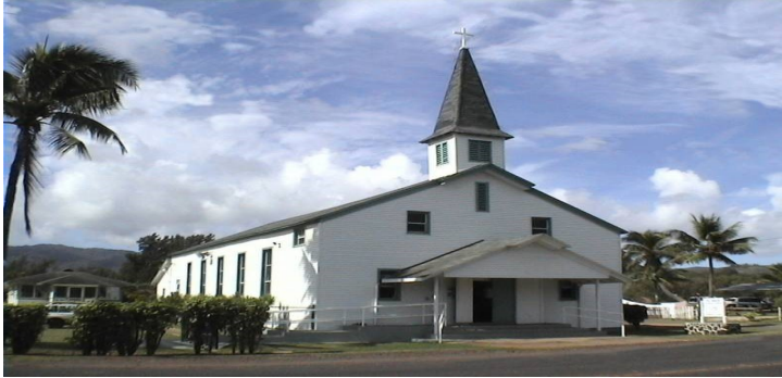
St. Roch Church

email: strochhi@gmail.com * Website: www.strochkahuku.com * Facebook: facebook.com/kahukuhawaii