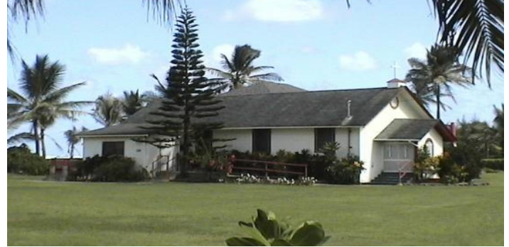
St. Joachim Church

Sunday Mass 7:30am Sunday Healing Mass 9:30am Daily Mass (Tues-Fri) and Communion Service (Mon) 9:00am