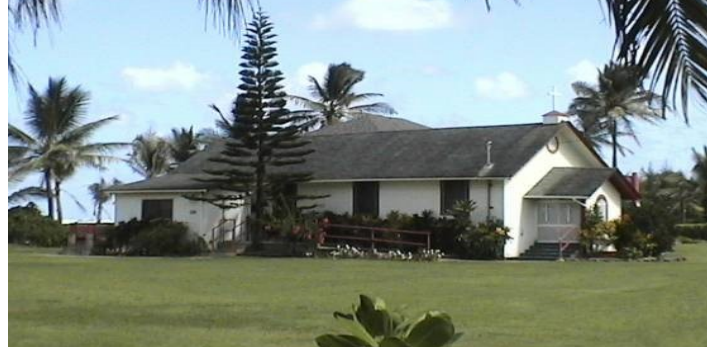
St. Joachim Church

Sunday Mass 7:30am Sunday Healing Mass 9:30am Daily Mass (Tues-Fri) and Communion Service (Mon) 9:00am