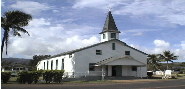
St. Roch Church

email: strochhi@gmail.com * Website: www.strochkahuku.com * Facebook: facebook.com/kahukuhawaii