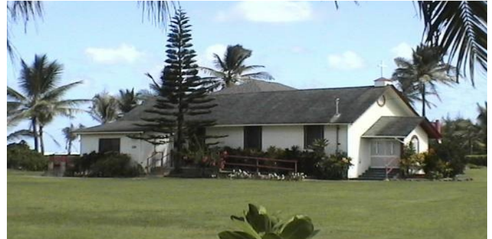
St. Joachim Church

Sunday Mass 7:30am Sunday Healing Mass 9:30am Daily Mass (Tues-Fri) and Communion Service (Mon) 9:00am