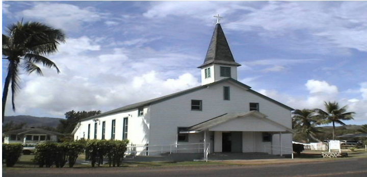
St. Roch Church

Parish Office: 808-293-5026 * Fax: 808-293-1737 * Rectory: 808-367-0631 email: strochhi@gmail.com * Website: www.strochkahuku.com * Facebook: facebook.com/kahukuhawaii