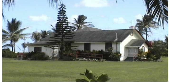
St. Joachim Mission Church

Daily Mass (Tues-Fri) and Communion Service (Mon) 9:00am